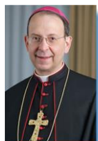
Supreme Chaplain Archbishop William E. Lori

http://www.kofc.org/en/columbia/supreme_chaplain/2018-02-lori-chaplain.html